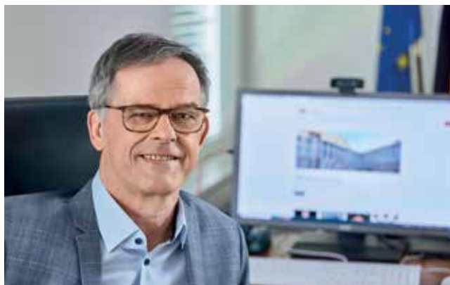
Umunyamabanga wa leta, Rudi Hoogvliet ashaka gukomeza imigenderanire.

Bade-Wurtemberg n' Uburundi bafitaniye imigenderanire kuva mu myaka y'i 1980 naho hahavuye haduka indyane za politike n'intambara. Ishirahamwe rya Bade-Wurtemberg rishingiye kw'iterambere n'imigenderanire (SEZ) ryatangujwe mu mwaka w'i 1991 kugira rifashe rinakomeze umuhora w' Uburundi. Mu mwaka w'i 2009, ikigo "Burundi competence center" carashinzwe. Igihe mu mwaka wa 2012 abanyagihugu bitanga mugushiraho ingendo n'amategeko agenga iterambere rya Bade-Wurtemberg, bashize agaciro kanini ku migenderanire. Hakurikiye amasezerano