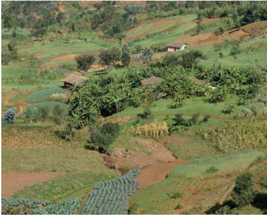
Agroforesterie itezimbere ibiribwa, irinjiza kandi irinda ikirere.

bigakora nk'intungamubiri y'isi. Uretse ibitoki n'ibiti vy'ipapayi bihinduka birebire, ivyamwa bigira igitutu kinini nka ficus, Neem, Grevillea n'ubundi bwoko butanu bwatewe. Bikanyisha Hasi kandi vyunguka imyumbati n'ibindi biribwa bifise intungamubiri. Kandi bitanga igitutu gikenewe m'ukurima ikawa ya Arabica.