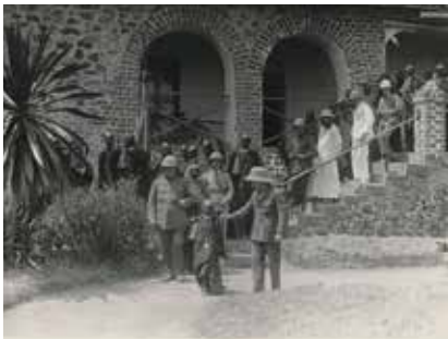
Umwami Mwambutsa, 1915 – 1966 n'abadagi

Ingaruka z'akahise basangiye ziracibonekeza. Uko vyose vyatanguye.